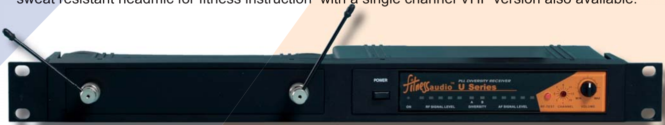
The U Series Receiver shown with optional MP50/MP12A rack mount kit.

The Fitness Audio® 16 Channel UHF Wireless Systems feature a Transmitter made for fitness users. It is a simply made case - no hinges or flaps, no external antennas to get broken off and only one On/Off switch. It is 9V Battery powered and the circuit board inside is protected from sweat damage by a coating of an Australian designed corrosion inhibitor. We deliver it with a dab of our Fitness Audio® eGloop electrical grease in the panel plug and on the battery tags to prevent corrosion. It's a total breakthrough in sweat protection! The Receiver has a "clean channel check" test button making setting up easier and it features a dual antenna diversity circuit for continuous reception with a reduced risk of dropouts. This is the recommended wireless system for the Aeromic & Cyclemic sweat resistant headmic for fitness instruction with a single channel VHF version also available.