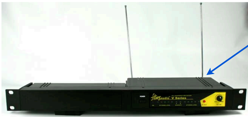
Front & Rear View of non-upgraded system